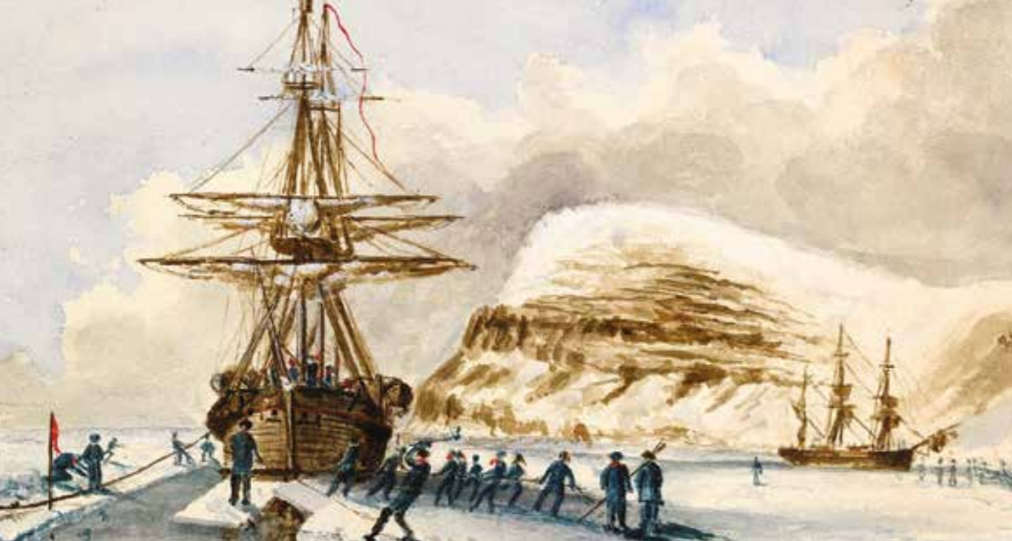
Archive of Captain S Gurney Cresswell, RN, 1842–67. Ships cutting through the ice to Port Leopold, Canada, 1848. FNL grant 2012.