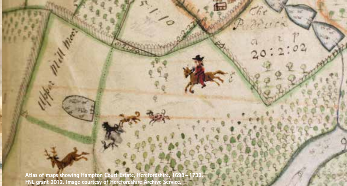
Atlas of maps showing Hampton Court Estate, Herefordshire, 1698 – 1733. FNL grant 2012.